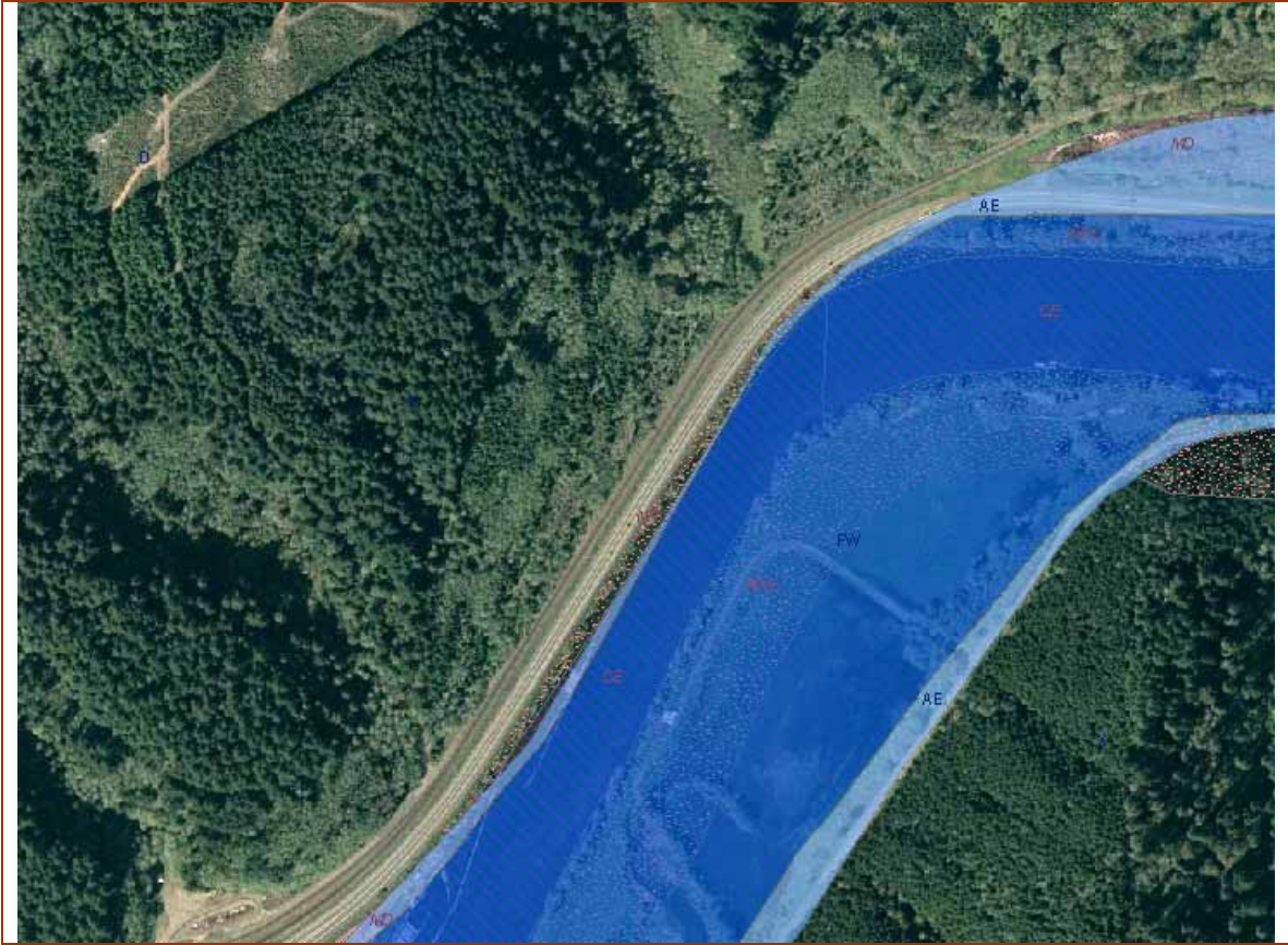
Vicinity of DMDP Site 47 - Coastal Resource Management Plan zoning designations.